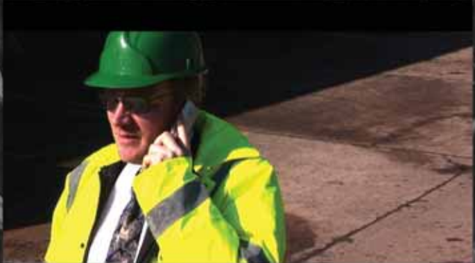
Thanks, but I also need a ...