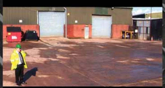
Morning, I need a ...