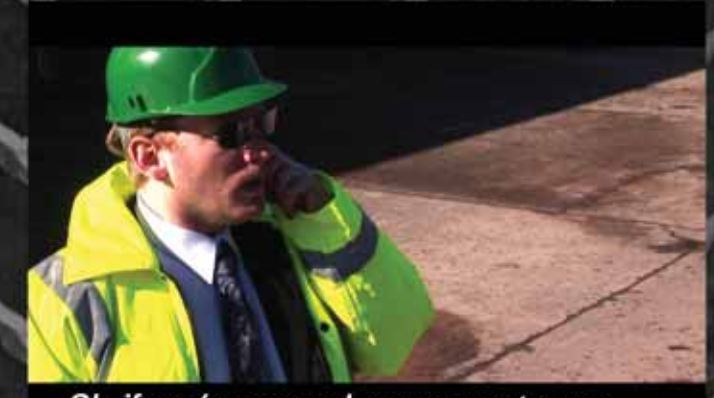
Ok, if you're so good, can you get me a...