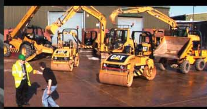
Your kit Sir and the cup of tea you ordered.