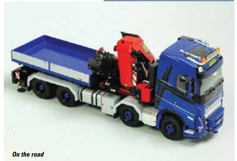
On the road