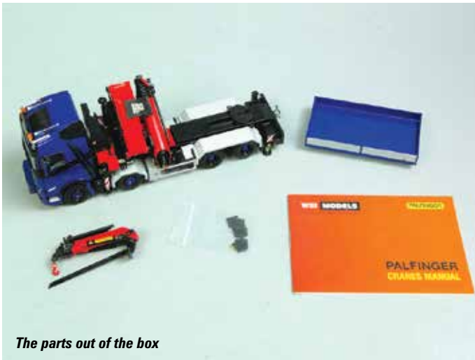
The parts out of the box