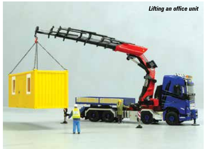
Lifting an office unit