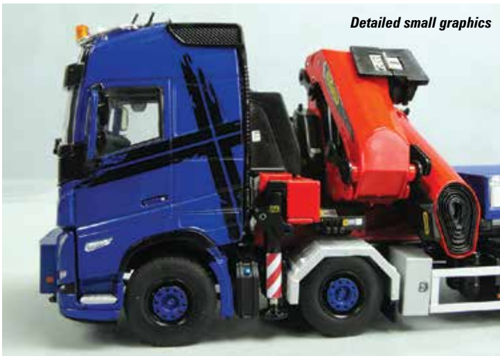
Detailed small graphics