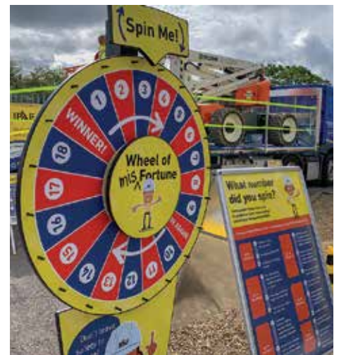
The wheel of Misfortune at Vertikal Days

IPAF used the Vertikal Days 2023 event on 10-11 May to promote its Load and Unload safety campaign. Visitors to the IPAF stand could try their hand at a "wheel of (mis) fortune" safety quiz to put their knowledge of safe loading and unloading to the test. All those who successfully passed the challenge were offered a water bottle courtesy of Warren Access. IPAF's representatives were also on hand to offer support and technical guidance including the latest leaflets, stickers, Andy Access safety posters and Toolbox Talk site safety briefings.