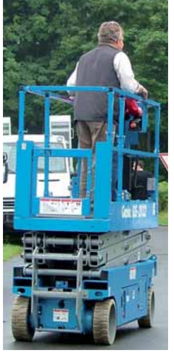
Not all 19ft scissor lifts are certified for outdoor use. Genie increased its width to 820mm to achieve this.

1. Weight: The 12 ft mast type machines weigh around 750kgs and