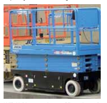
Will Aichi start to import CE versions of its scissor lifts this year?

The aerial lift market continues to grow, estimates indicate that in 2006 over 100,000 new lifts were shipped for the first time and is set to grow by at least a further five percent in 2007. The growth has extended lead times significantly which is not all bad. However significant additional production capacity is now coming on stream.