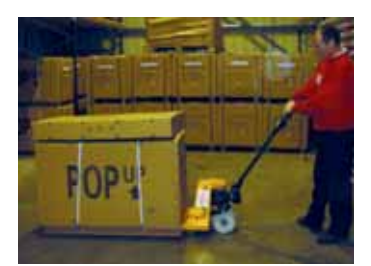
The Pop-Ups arrive in packed in cardboard boxes.

Introduced at last year's Hire show in January, the PopUp is not self propelled, it is a push around scissor lift. With a weight of only 272kgs though, it is easy enough to handle. Once in place and the castors