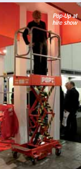
Pop-Up at hire show

Samuel Walker the crane and access service company for Grove and PAT/Ascocel distributor appoints an administrator and very quickly appoints a liquidator.