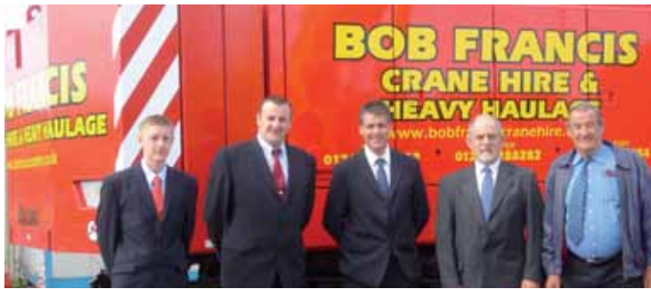
Bob Francis buys first Manitowoc branded Kobelco crawler crane in Europe.

Butler Capital Partners buys out Access Industries in France.