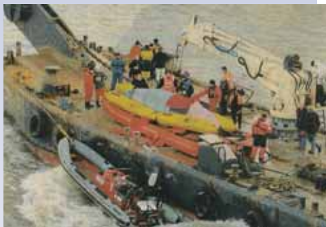
A whale stranded in the Thames is lifted with an Effer marine crane onto a barge and taken out to sea. It did not survive the voyage.