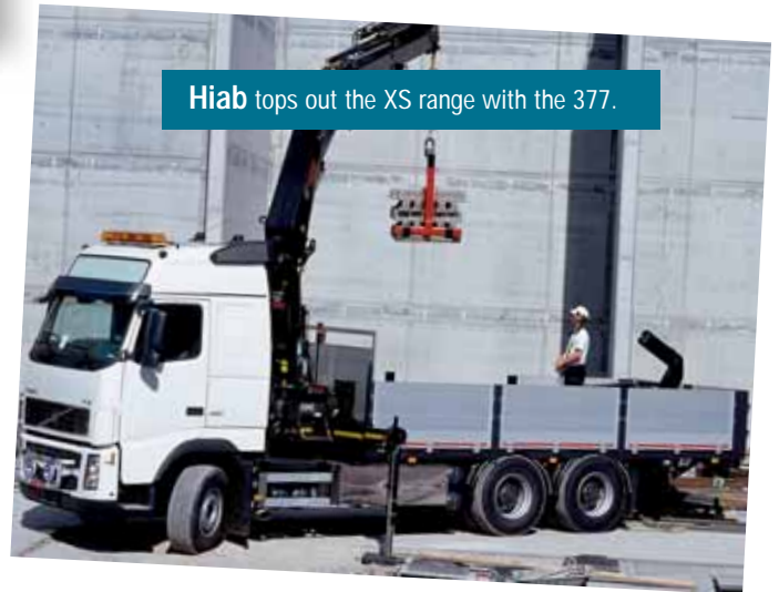
Hiab tops out the XS range with the 377.

Wolesey buys Brandon Hire merging it with its Hire Centre chain rebranding them all as Brandon.