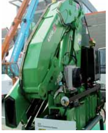
An Amco Veba 936 crane

The Hyva Group of Alphen aan den Rijn, Holland has acquired Amco Veba of Poviglio, Italy. Hyva, a €200 million business, whose largest shareholder is 3i, owns Kennis, the Budel based loader crane producer which at one time was teamed up with Effer. Amco Veba not only produces its own range of loader cranes of up to 85 tonne/metres but also owns Ferrari which has traditionally built smaller articulated loader cranes. The combined loader crane production