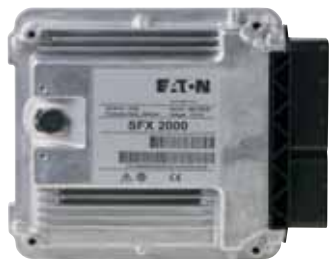
The new Eaton SFX200o controller

"These new controllers are designed specifically for applications where control loop times are critical," says Eaton product manager Christophe Natter. "In addition, both the SFX 1000 and SFX 2000 controllers have an internal Freescale HC 908 'watchdog CPU' and monitoring software that enables them to comply with the IEC 61508 safety standard. When used as stand-alone controllers they meet SIL 2 requirements for off-highway vehicle applications."