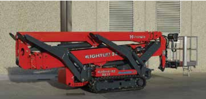
The new machine has compact stowed dimensions for its size

The Hinowa Lightlift 33.17 IIIS features a four section lower boom, three section top boom and jib.