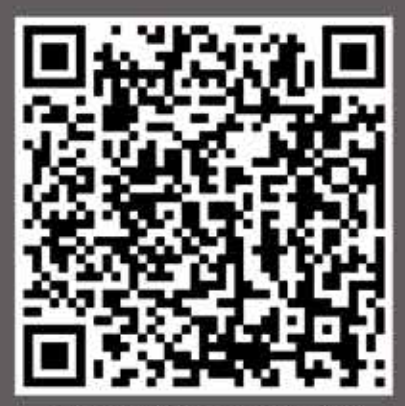
USE SMART PHONE Q R CODE READER