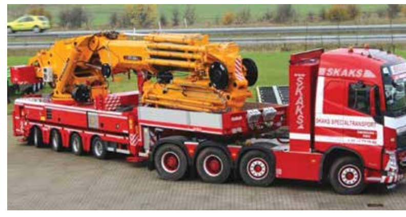
The crane is mounted on a four axle trailer pulled by four axle tractor unit. The unit travels fully rigged.

Skaks Specialtransport of Rødekro, south west Denmark has taken delivery of a World Power Erkin 375.000 heavy duty knuckle boom crane. The massive crane can lift 13 tonnes to a height of 33 metres, while maximum capacity is 67 tonnes at 5.4 metres. The crane which travels with full counterweight is mounted on a special four axle Nooteboom trailer, coupled to a four axle Volvo tractor unit and sits on its own sub-frame which incorporates the beam and jack outriggers. Skaks runs several World Power cranes including an ER356.000L8, which it says are ideal for machinery moving type applications.