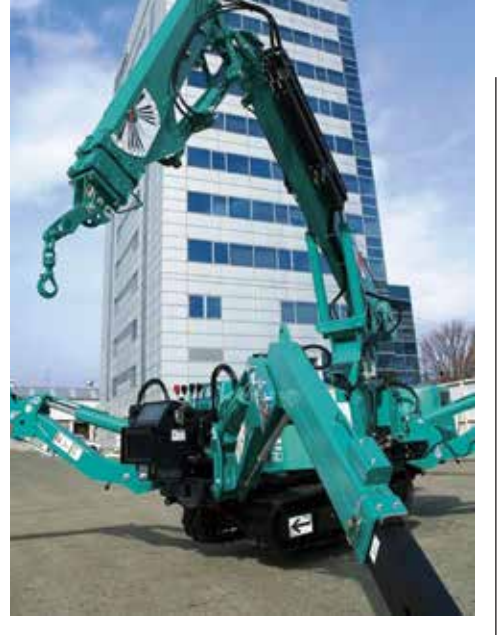
City Lifting has taken delivery of the first Maeda MK1033CWE-1 spider crane in the UK

The bi-energy 995kg capacity crane features a three section main boom and three section telescopic jib giving an up and over height of 7.5 metres. Maximum lift height is 11.3 metres with features including a detachable electric pack and an auxiliary winch. The company also took delivery of two diesel/electric MC 405 CRMEs bringing its Maeda spider crane fleet to 10.