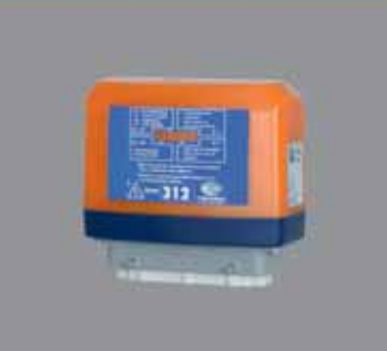
Handle the most demanding machine Control industrial cranes and chain hoists easily and efficiently with the FSE 308 and FSE 312 plug & play receivers!