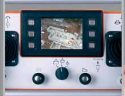
Work safely and precisely even in areas. with limited view with the live video transmission by video camera!