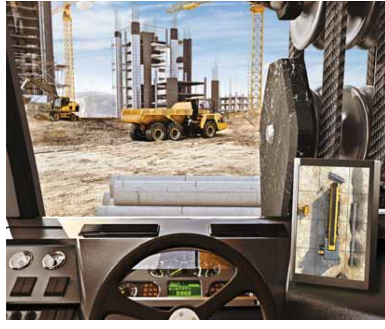
A bird-eye view of the vehicle and its surroundings are displayed on a screen in the cab.

The company claims the system not only improves safety for the driver, vehicle and other road users but it also enhances the efficiency of vehicle operations because manoeuvrings take less time, with less risk of damage, less down time and reduced repair costs.