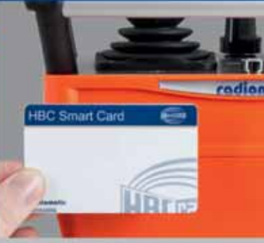
Manage access rights and gather operational information by data logger and user identification!