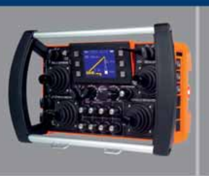
operations conveniently with the new spectrum E transmitter!