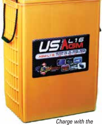
correct amp/hour transformer.