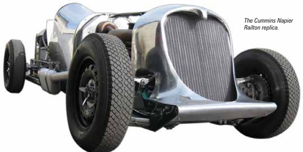
The Cummins Napier Railton replica.