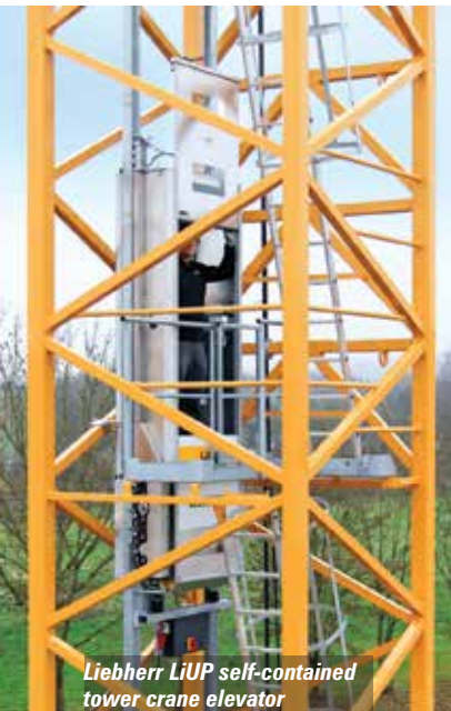
Liebherr LiUP self-contained tower crane elevator

the Vertikal Press will be there of course, reporting on developments and meeting readers and sponsors. Find us between outside areas Ext 5 & Ext 6.