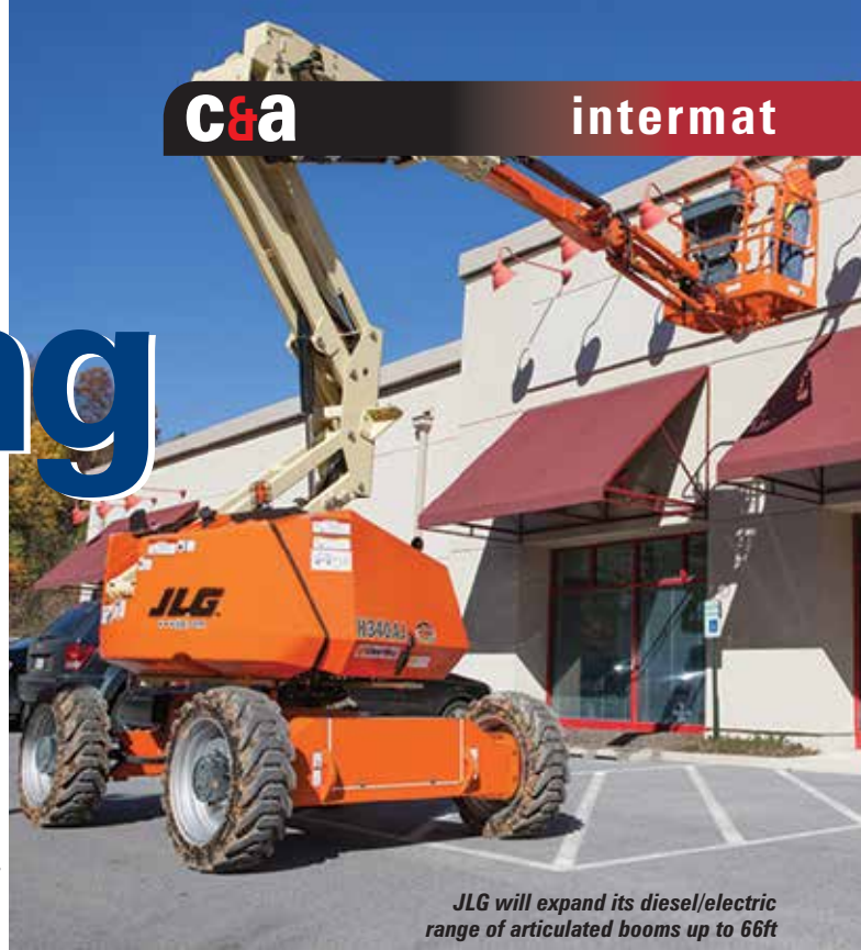
JLG will expand its diesel/electric range of articulated booms up to 66ft

Why should you go? Well, Paris is not an unattractive destination in the spring, the Euro is currently weak so if you are coming from outside the Euro zone, you will find its delights are a lot less expensive than in the past. And lest we forget there will