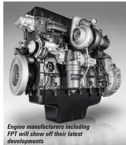
Engine manufacturers including FPT will show off their latest developments

Winner of an Intermat Gold Award, the Liebherr LiUP self-contained tower crane elevator can be fitted on new or old towers. The 200kg capacity, 25m/min two man elevator rides on the inside of larger towers and on the outside of smaller ones using a double rack and pinion drive with dual rails, which can be left permanently installed. It is completely self-contained and fully autonomous, driven by a lithium ion battery mounted at the base. When