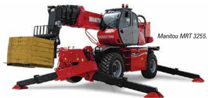
Manitou MRT 3255.