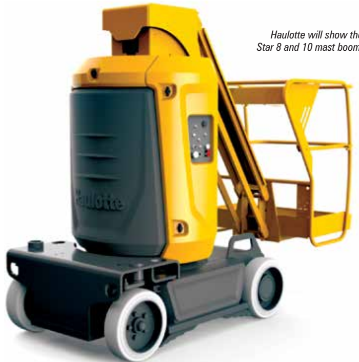
Haulotte will show the Star 8 and 10 mast boom.

be a good number of interesting new products and ideas to see.