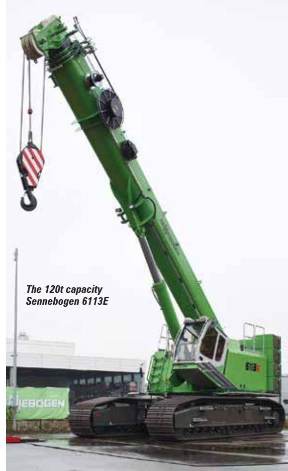
The 120t capacity Sennebogen 6113E

Many engine manufacturers including Cummins, Deutz, FPT, Kohler/Lombardini will have engines and developments aimed at complying with the latest regulations. Cummins will also show a replica of the famous 1930s race car - the Cummins Napier Railton - powered by a 6.7 litre Cummins diesel with power boosted to 500hp. Looks like a show not to miss and