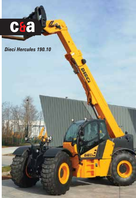
Dieci Hercules 190.10

JLG will have a number of new models on show, including new hybrid-power articulated boom lifts, an all-new Rough Terrain scissor lift, new mid-range boom lifts and a new 26 metre X26J Plus - with 230kg unrestricted platform capacity and lithium ion battery pack. The company is giving little information away on the launches, but it is thought the new hybrid booms will use the same diesel/electric concept as the current H340AJ with four AC electric wheel motors extending the range from 34 to 66ft. Substantial updates to its ES slab scissor range will include a new steel deck, new steel covers, an increased overall width from 30 to 32 inches and new controller to meet the latest European standards.