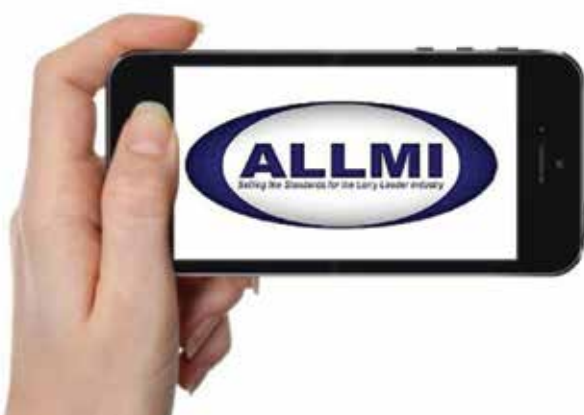
ALLMI plans to develop a smart phone app later this year.

The association is looking for feedback on other features which could be included in the app – should you wish to contribute ideas or suggestions then please contact ALLMI.