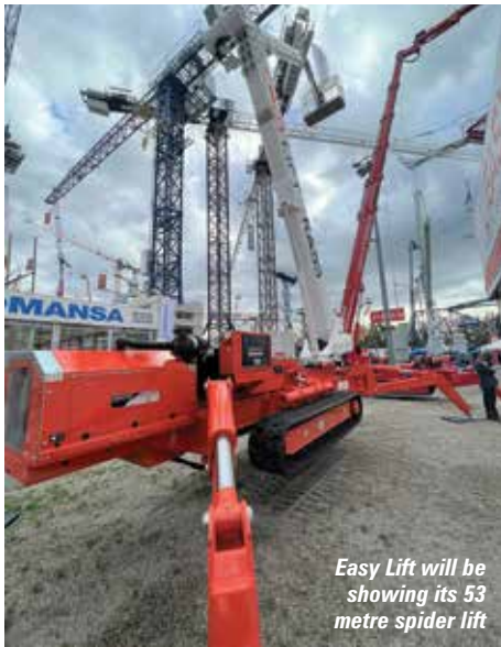
Easy Lift will be showing its 53 metre spider lift

Moving on to spider lifts, all of the major suppliers will be present several promoting larger machines topped by Palazzani with its 58 metre model shown as a prototype at Bauma, and Easylift with its 53 metre model. Also the original manufacturer Falcon (Falck Schmidt) will be there and interested to discuss 50 metre plus machines, while fellow Dane Ommelift has also been busy. Getting back to electrification, most spider lift manufactures now offer lithium power options or even as standard. The lithium pioneer Hinowa has started shipping its new 40 metre so hopefully you will see the full production version