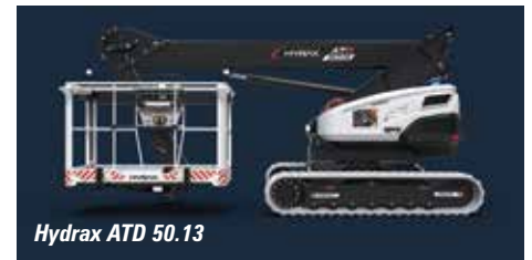
Hyrax ATD 50.13

While promoted as a dedicated access exhibition, most of the major spider crane manufacturers will be represented, including Jekko, Hoefflon, Maeda and Unic. It seems that spider and mini cranes often fit better with aerial lift rental companies. Continuing with other products, if you are not familiar with battery electric telehandlers check out the Faresin stand where you can see its increasingly popular 626 Full Electric and finally the show also presents an opportunity to look at glass handling robots, both on the spider crane stands and Winlet which builds dedicated machines.