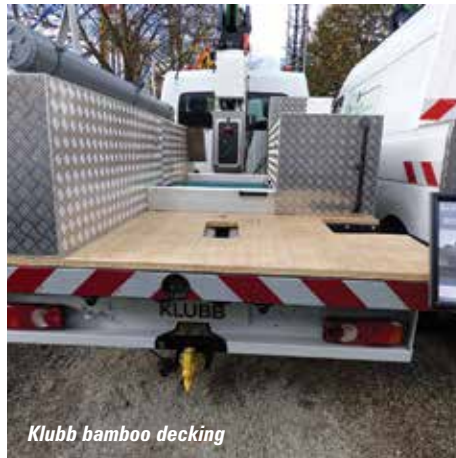
Klubb bamboo decking

If vehicle mounted lifts are your thing the increasingly competitive market has led to a plethora of new models and developments. Multitel - which also has its spider lifts on display - Palfinger, Comet, GSR, Klubb which now also owns Isoli and the Time group which now includes France Élévateur, Movex, Ruthmann and Versalift all have plenty to show and plenty to talk about. Once again, we return to electrification -